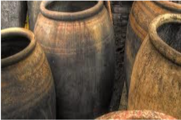
Six Stone Jars at the Wedding at Cana